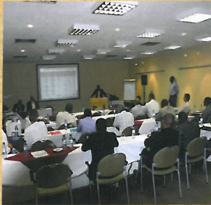
Financial institutions consulting with MURD

In the spirit of Harambee and the declaration of an all-out war on poverty by our President, the Ministry urge for your partnership and for you to join hands with the Government in enabling fellow Namibians to realise their dreams of owning a home.