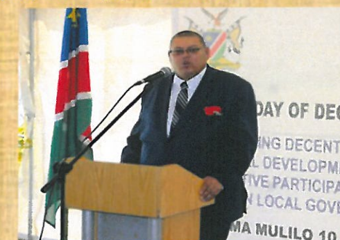
Hon. Derek Klazen MP, Deputy Minister of Urban and Rural Development