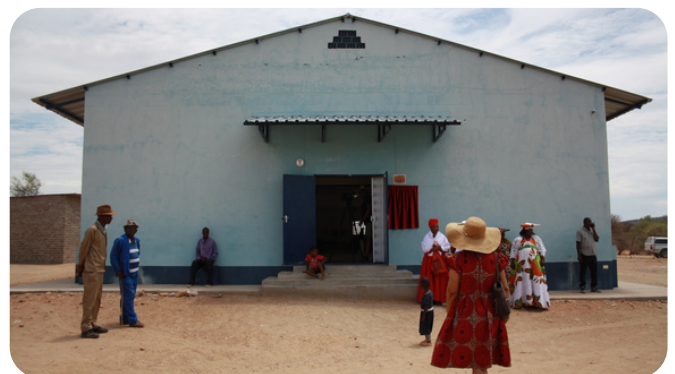
The /Gaio-Daman Community Hall.