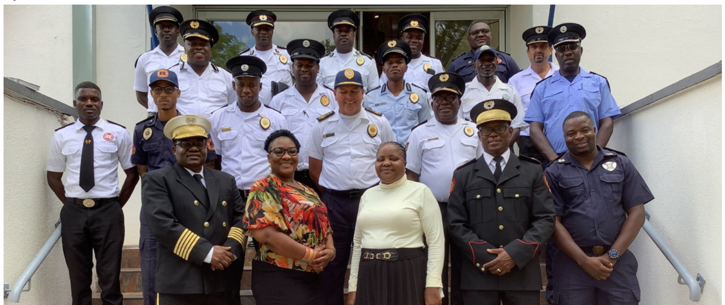
Chief Fire Officers

The meeting was aimed at exchanging views and securing consensus and solutions to identified shared challenges as well as standard emergency operational procedures. The meeting was attended by 20 Chief Fire Officers from 20 Local Authorities.