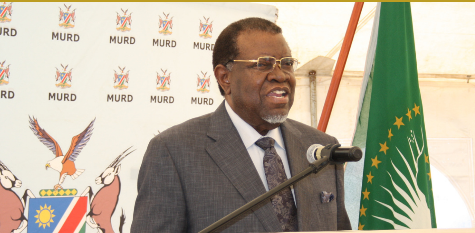
H.E. Dr Hage Geingob, President of the Republic of Namibia