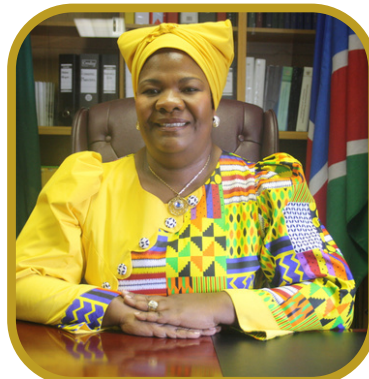
Hon. Eveline !Nawases-Taeyele Deputy Minister